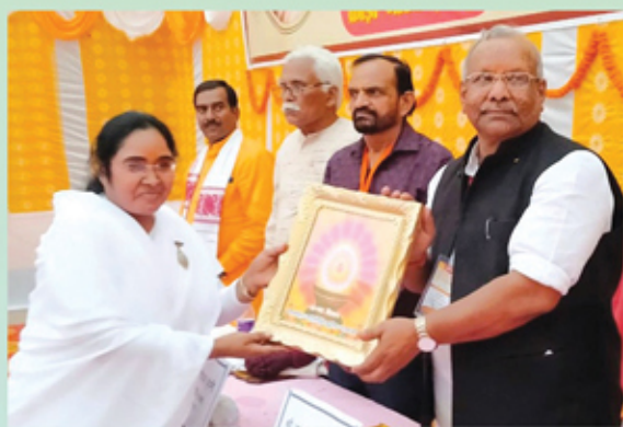
Sasaram (Bihar): Mr. Tarkishore Prasad, Deputy Chief Minister is being given Godly gift by BK Babita.