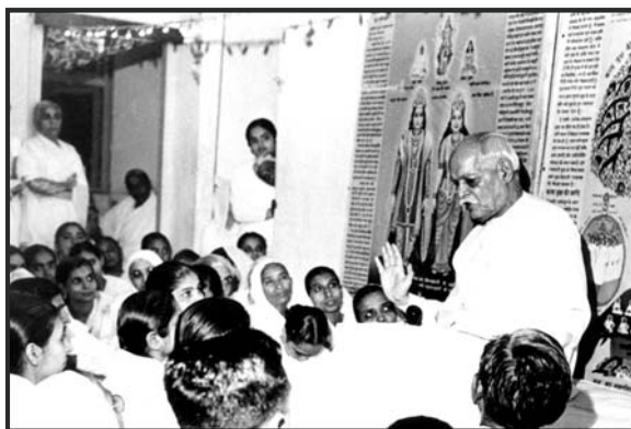
Godly knowledge is being explained by Brahma Baba

Every deed of Baba was exemplary. Corporeal Baba taught everything to the children through his actions from the beginning of the yagya . From morning till night, Baba's entire routine was well-organized. Baba did not waste even a single moment of his life. At all times Baba was engaged in the service of souls and gross works of yagya . Although Baba's age at that time was close to 90 years, yet Brahma Baba used to do service in such a way that even the youth would get tired but Baba did not get tired.